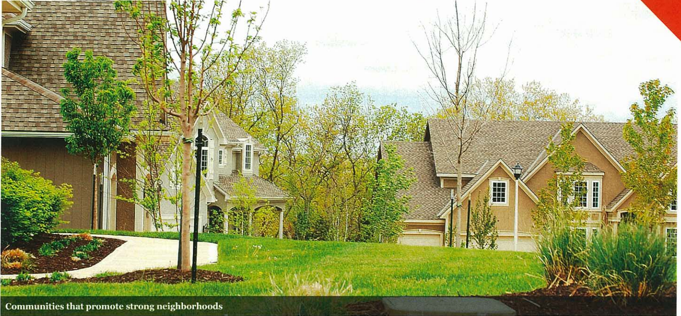
Communities that promote strong neighborhoods