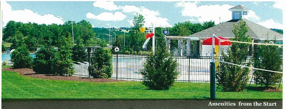
Amenities from the Start